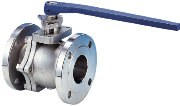
Fig No. MD-82 Full Bore 1/2" ~ 12" (DN 15 ~ DN 300)