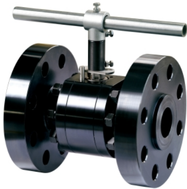
Fig no. HPV-43FS Full Bore 1/2" - 2" DN15 - DN50