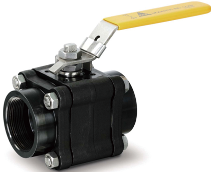
Fig no. V-755FSA Reduced Bore 1/4" ~ 2" DN 8 - DN 50