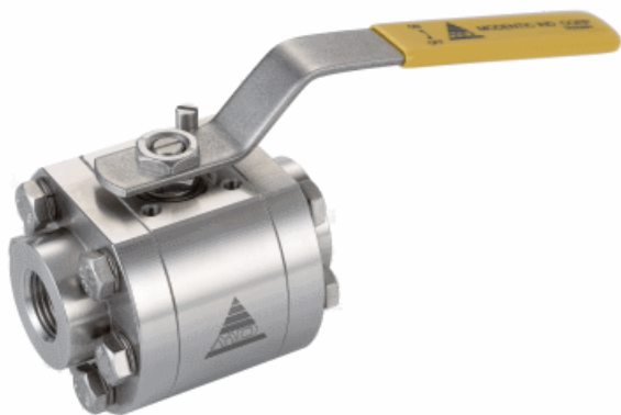
Fig no. HPV-41FSA Reduced Bore 1/4" ~ 2" DN 8- DN 50