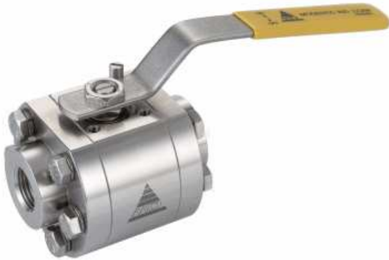
Fig no. HPV-40 Full Bore 1/4" ~ 2" DN 8- DN 50