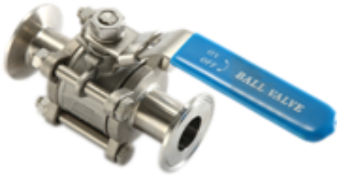
Fig no. V-Z05TC Tube Bore 1/2" - 4" DN15 ~ DN100