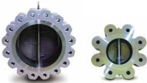
Fig No: MV-1221 1-1/2" ~ 60" DN40 ~ DN1500